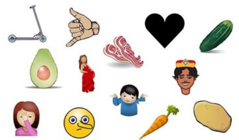
( artsandculture/article/24830/1/38-new-emoji-selfie-wilting-flower-avocado-technology-internet )

Sofia Coppola is set to direct America's favourite uncle in 'A Very Murray Christmas'