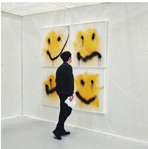
( artsandculture/article/24836/1/best-of-frieze-new-york-as-seen-through-instagram )

Arts+Culture Arts and Culture (/tag/artsandculture) Yesterday