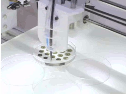
Photocells being printed

Especially interesting was Oron Catts ( http://tcaproject.org/ ) highlighting the hype around synthetic biology. By way of illustrating his latest work – the 'Mechanism of Life' ( https://www.youtube.com/watch?v=G3DRmq1phGQ ) wherein a 3D printer prints protocells – he notes that synthetic biology is a century old term steeped in the at times fierce debate about what constitutes a living thing.